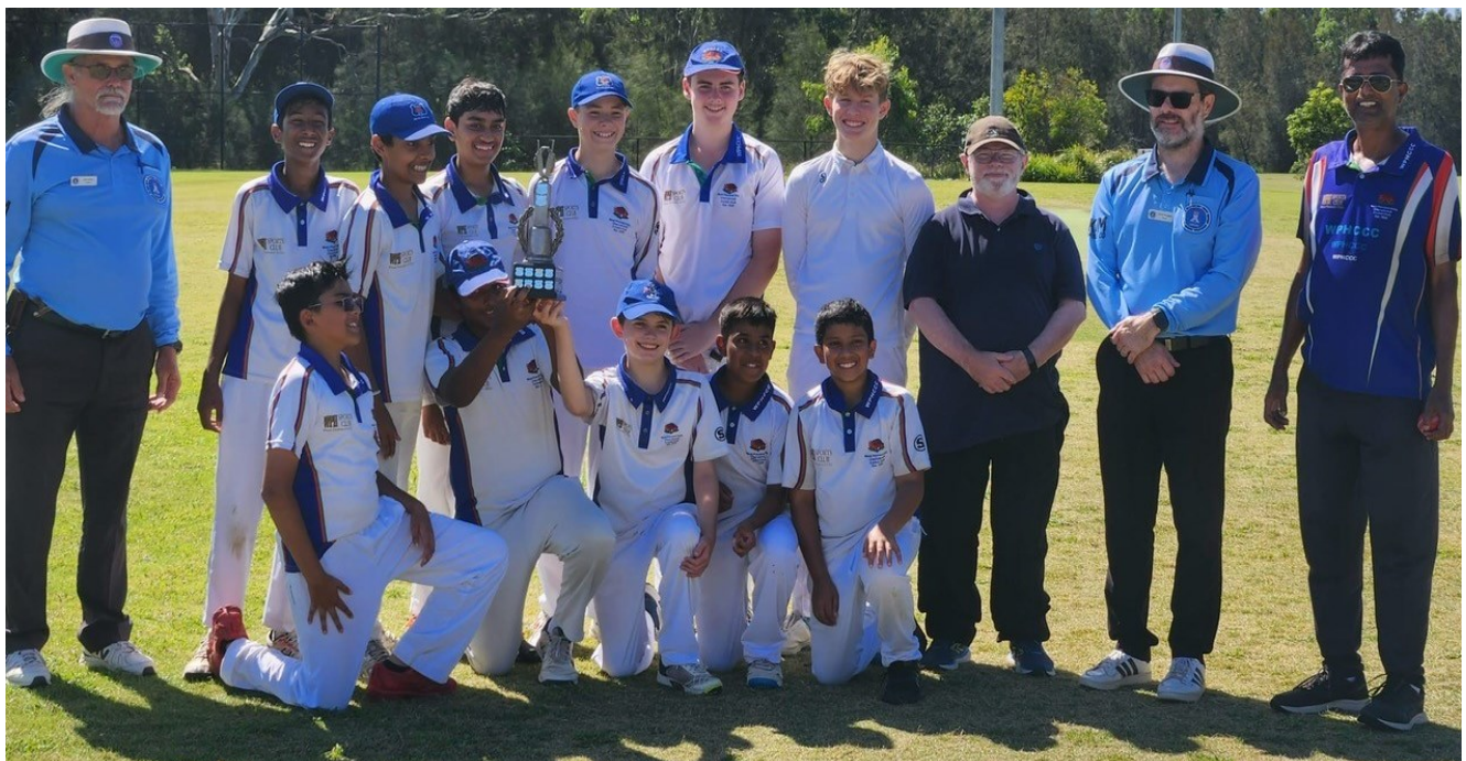
U14 Premiers—West Pennant Hills Cherrybrook