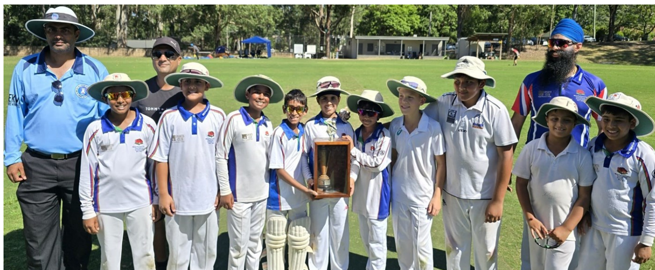
U12 Premiers—West Pennant Hills Cherrybrook