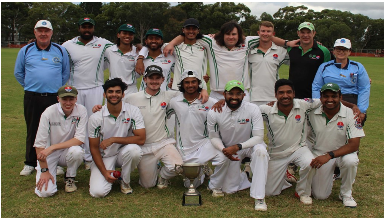
C2 Grade Premiers - Castle Hill RSL CC