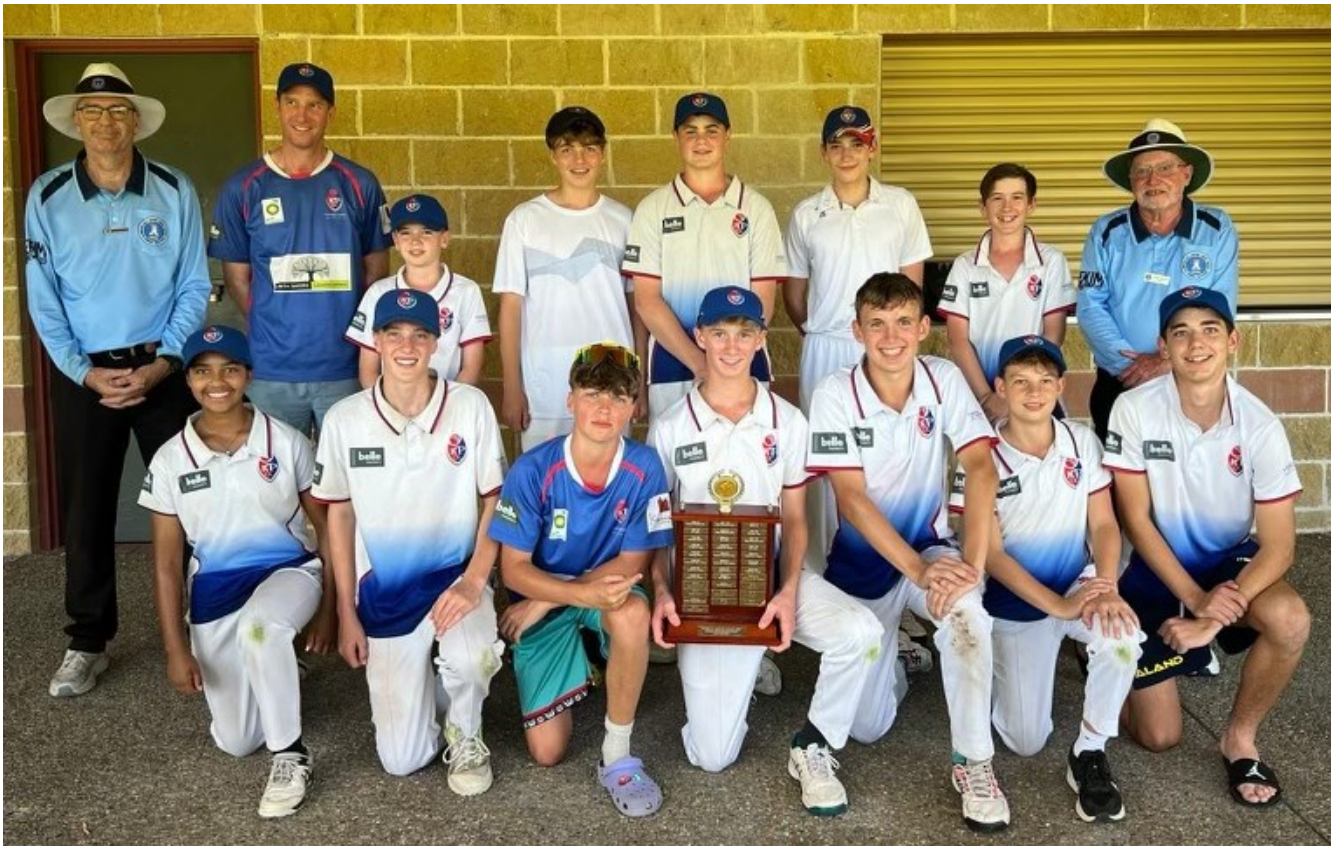
U15 Premiers—Kissing Point