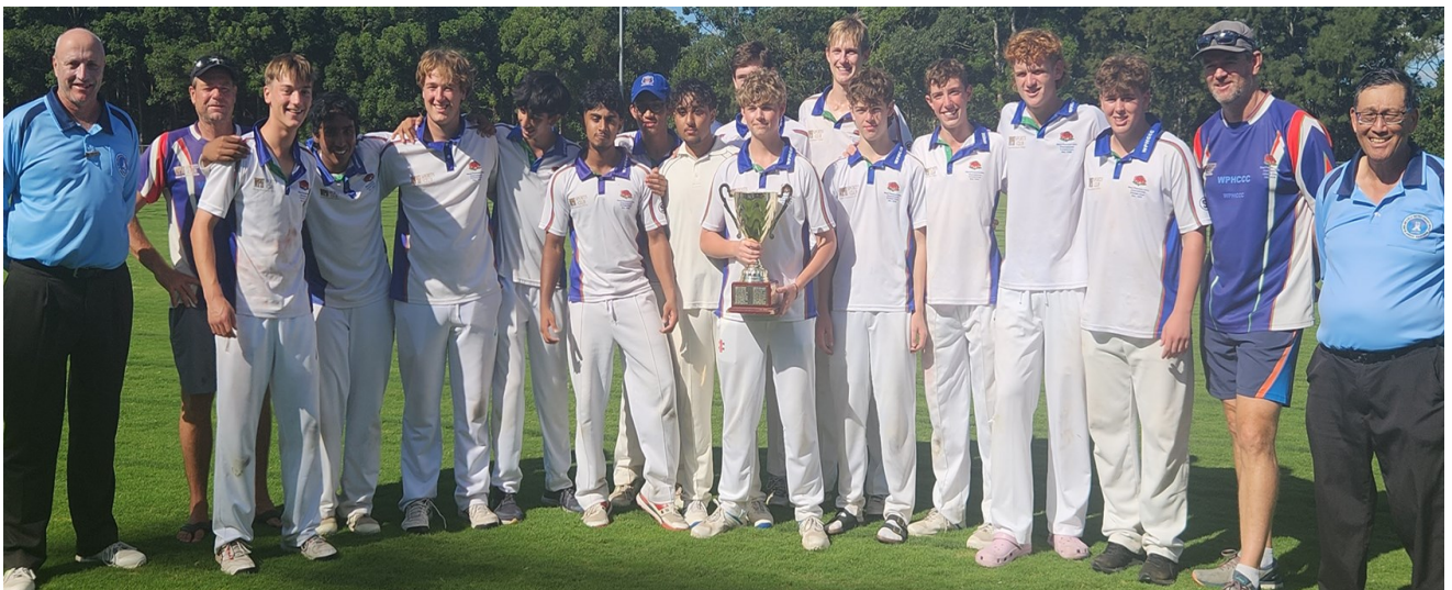
U17 Premiers—West Pennant Hills Cherrybrook