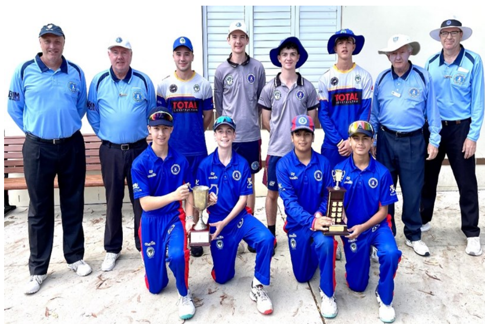
RTC and GHC captains and coaches