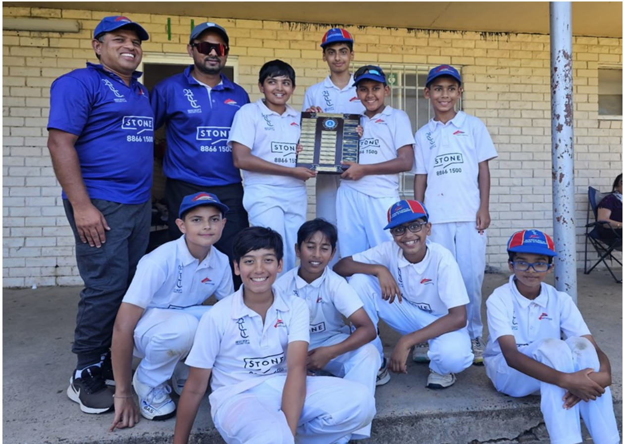
U13 Premiers—Pennant Hills-Becroft