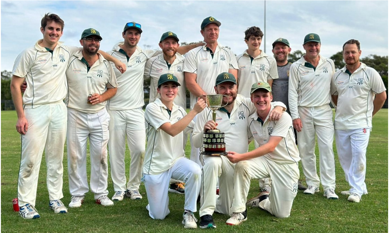
C Grade Premiers - Glenorie District CC